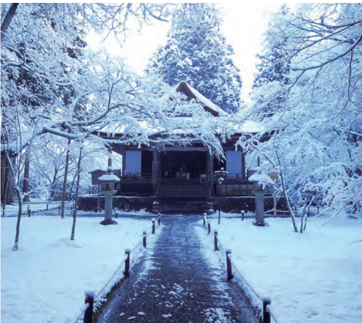
Ojo-Gokuraku-in in winter