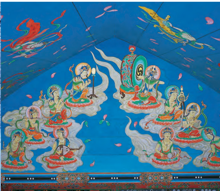
Reproduction of the painting on the ship's-hull shaped ceiling of Ojo-Gokuraku-in Hall (Inside Ennyu-zo)