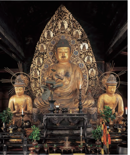
Amitabha Trinity (National Treasure)

The Ohara area has been known as Gyozan for more than a thousand years. It is the birthplace of Shomyo (Buddhist sutra chanting) and known as a sacred spot in the belief of Jodo (Pure Land Buddhism) among Nembutsu-Hijiri (prayer mendicant priests). Sanzen-in Temple was originally established as a hermitage by Saicho (767-822), or Dengyo Daishi, when he founded Enryakuji Temple on Mt. Hiei, Shiga Prefecture. The temple, also known as Kajii Monzeki or Nashimoto Monzeki, is one of the five Tendai Monzeki temples, and certain members of the imperial family served here in the priesthood throughout the temple's history. It was officially named Sanzen-in in 1871, according to documentation written by Emperor Reigen in the Jibutsu-do hall of Kajii Goten (the temple building), following the departure of an imperial prince priest from the priesthood.