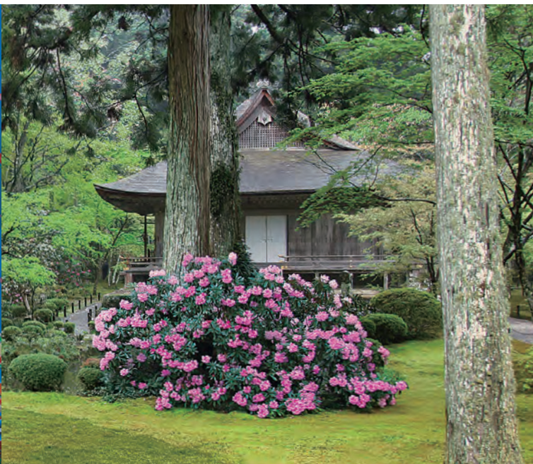
Ojo-Gokuraku-in in spring